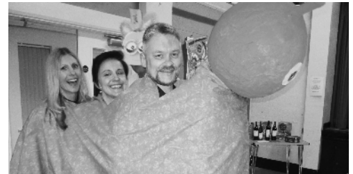
Best Group - The Hungry Caterpillar