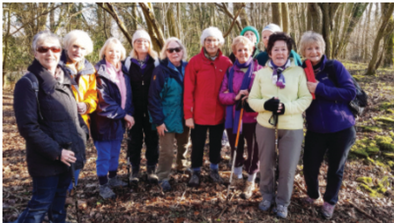
Twyver Walkers on a rare sunny February day! and the church they visited. See article on Page 2.