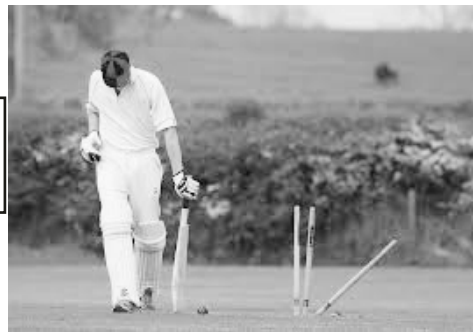
Well, there's always the next innings!