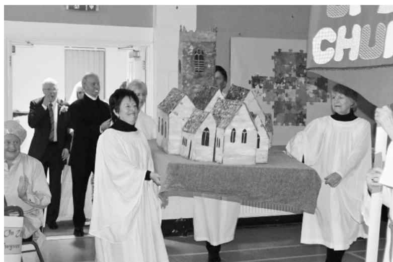
They are literally Carrying on Upton Church!